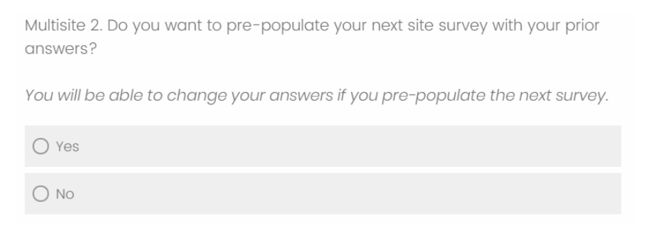
Step 4: Review and submit your responses for the first survey.

Step 3 : Decide whether to copy your prior answers or respond to a blank copy of the survey. Selecting "Yes" in Multisite 2 will pre-populate your next survey with all your previous answers. You will be able to change any of your answers as needed. Selecting "No" will give you a link to a completely blank new survey.